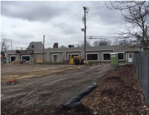
Highland Parkway, looking south