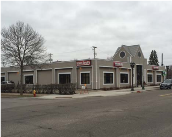
Cleveland Avenue and Pinehurst Avenue