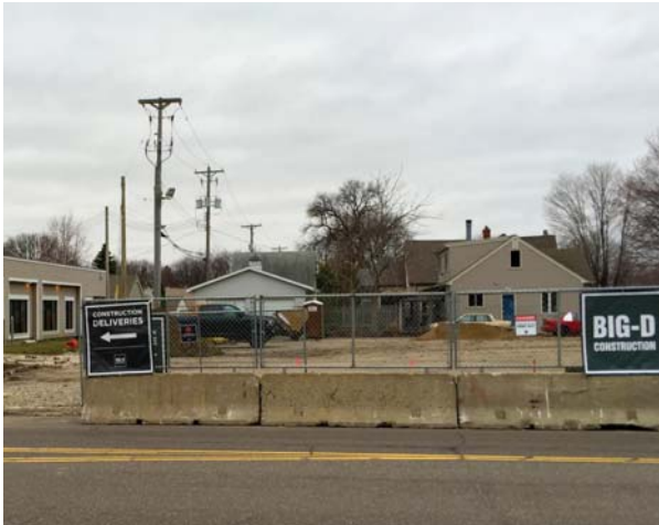
735 Cleveland Avenue, mid-block