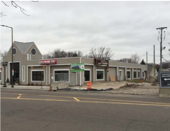
735 Cleveland Avenue, mid-block