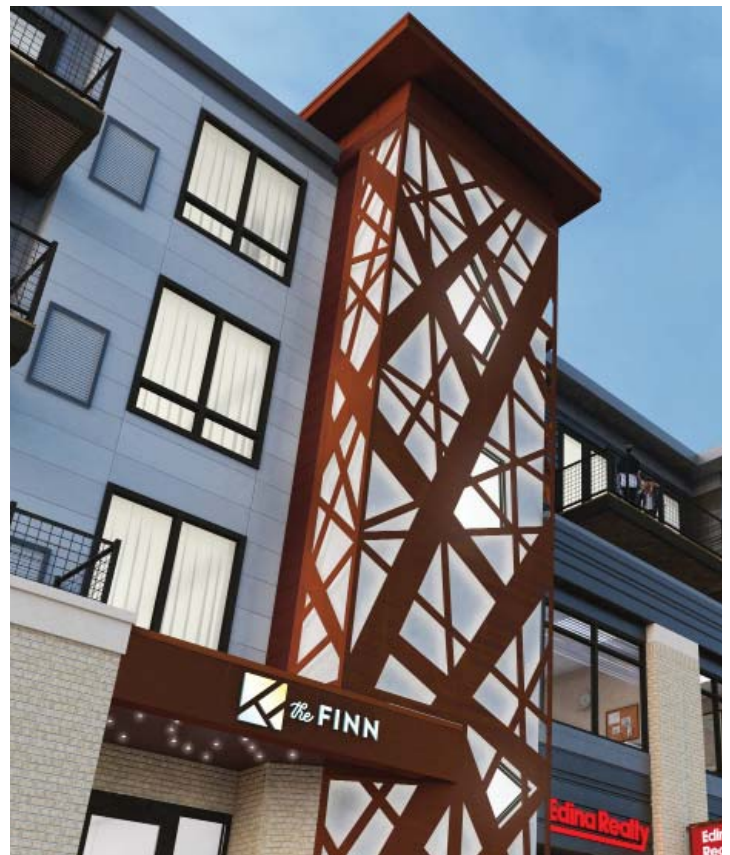
Rendering from Cleveland Ave S. (mid-block) looking northwest