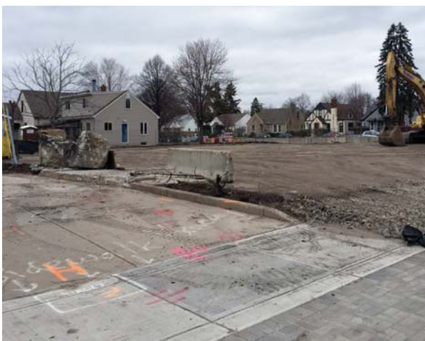
735 Cleveland Avenue, mid-block