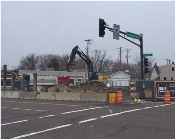
Cleveland Avenue and Highland Parkway